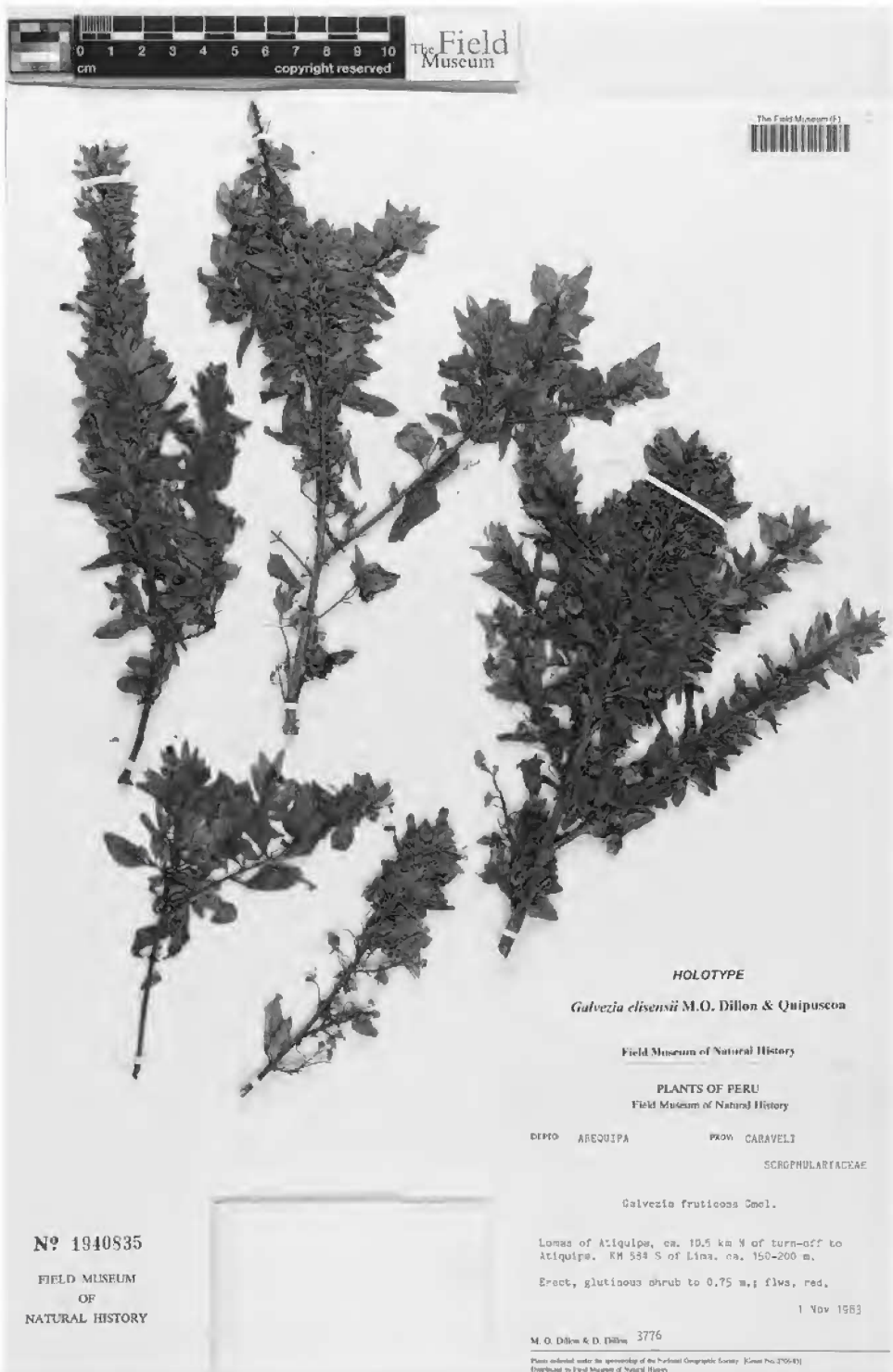
Fig. 1. Galvezia elisensii . Photograph of holotype collection, M. Dillon & D. Dillon 3776 (F1940835).